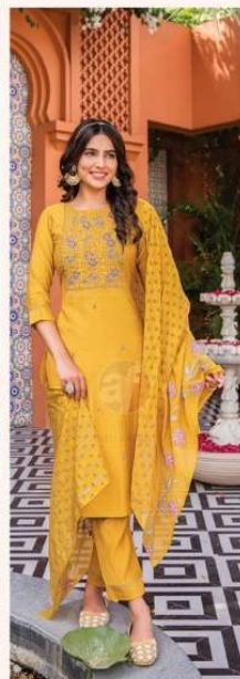
Once More 3246