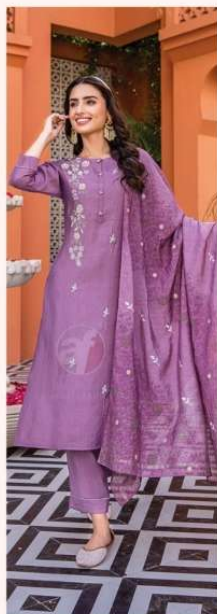
Once More 3241