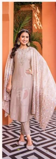
Once More 3245