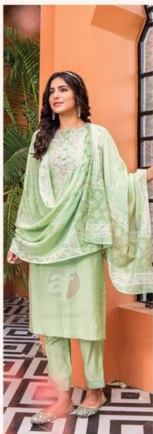
Once More 3242