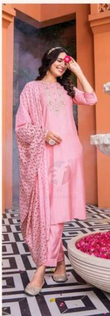
Once More 3243