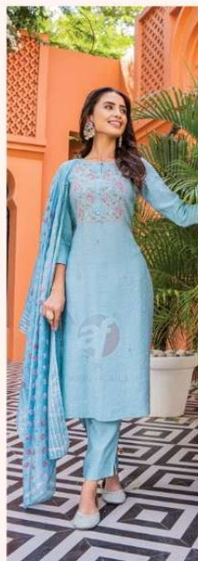
Once More 3244