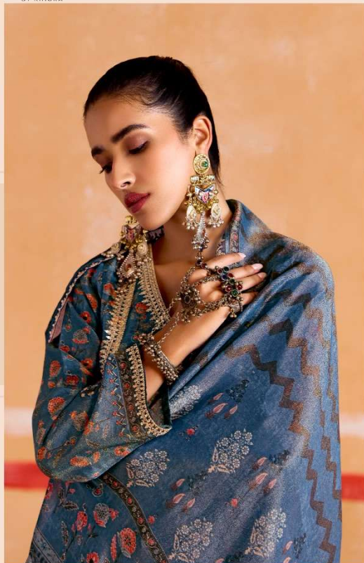
9544 Style is the way you carry your dress with confidence and charm.